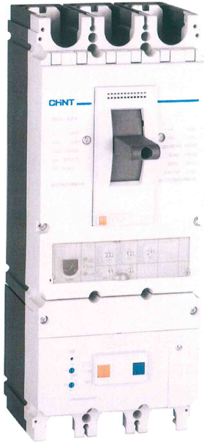
Images of NM8NL series

Signed for and on behalf of Zhejiang CHINT Electrics Co., Ltd. — Chint Industrial Zone, March 26, 2020