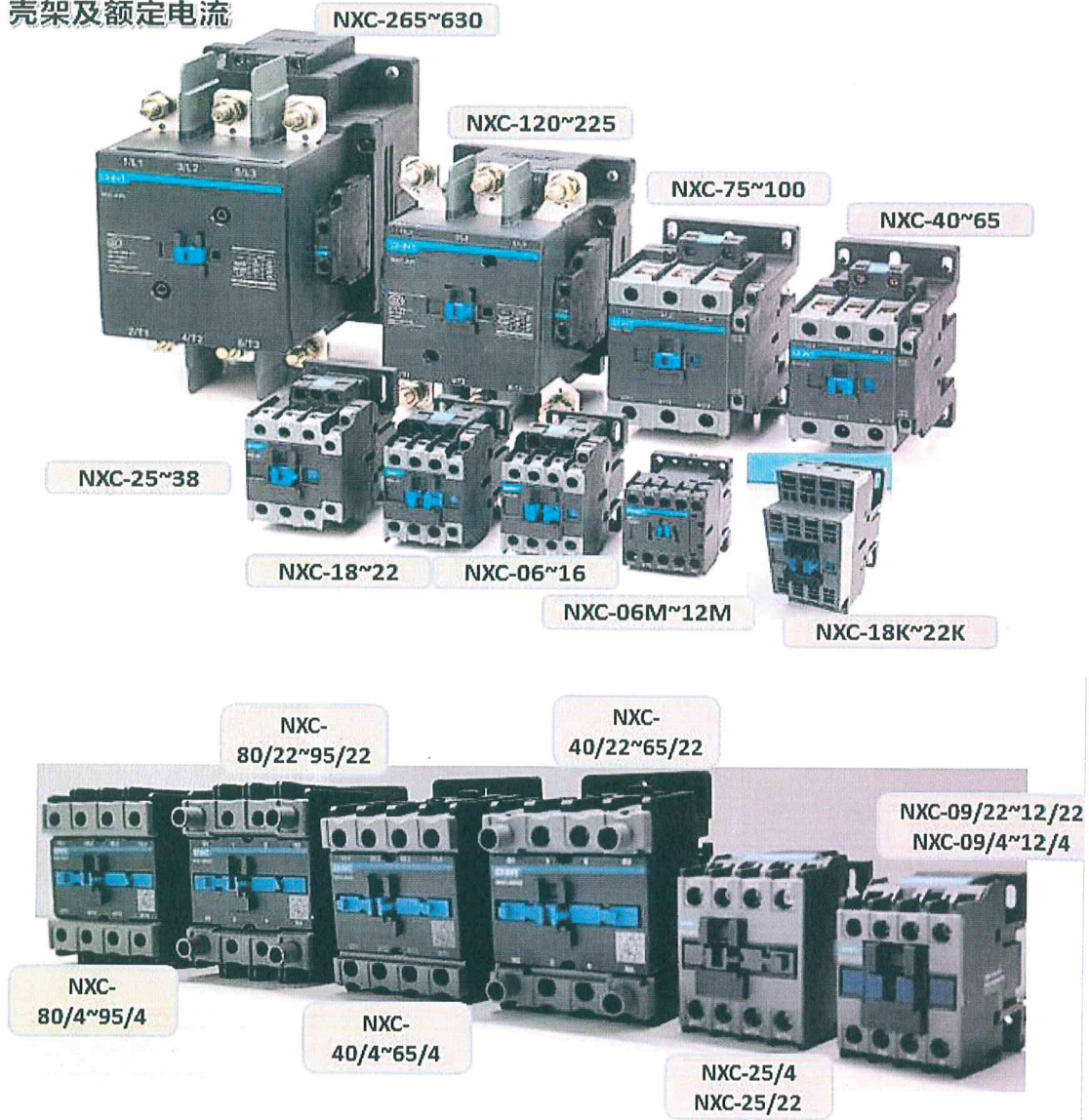
Images of NXC series