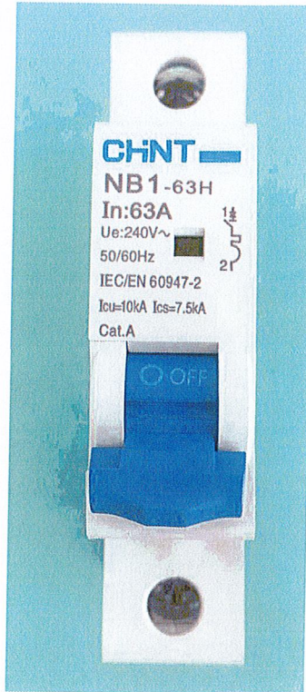
Images of NB1-63H