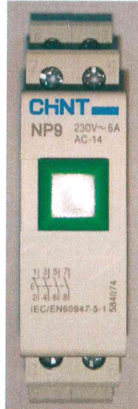
Images of NP9