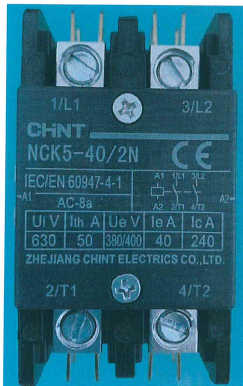
Images of NCK5